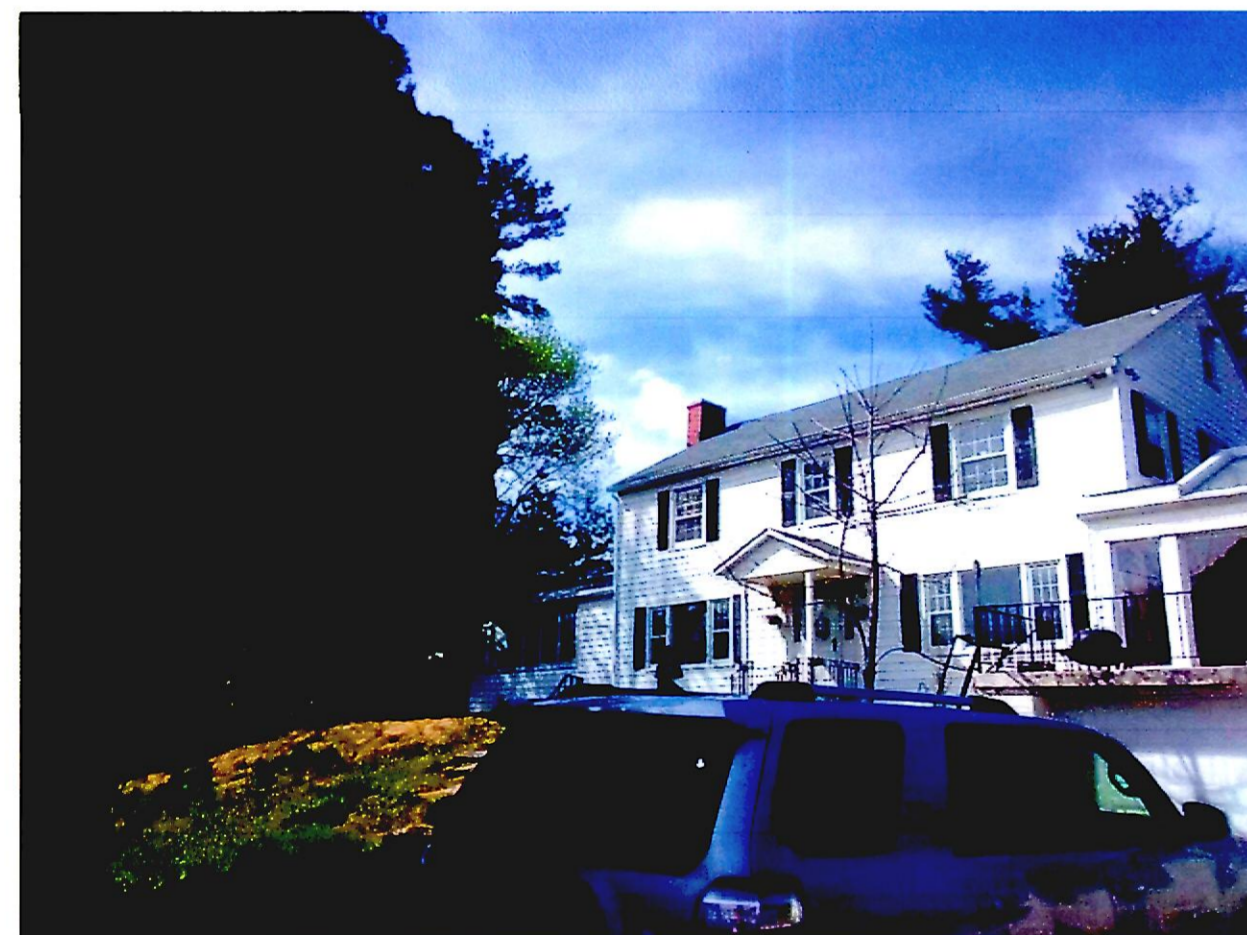
EXISTING HOUSE PHOTO NOT TO SCALE