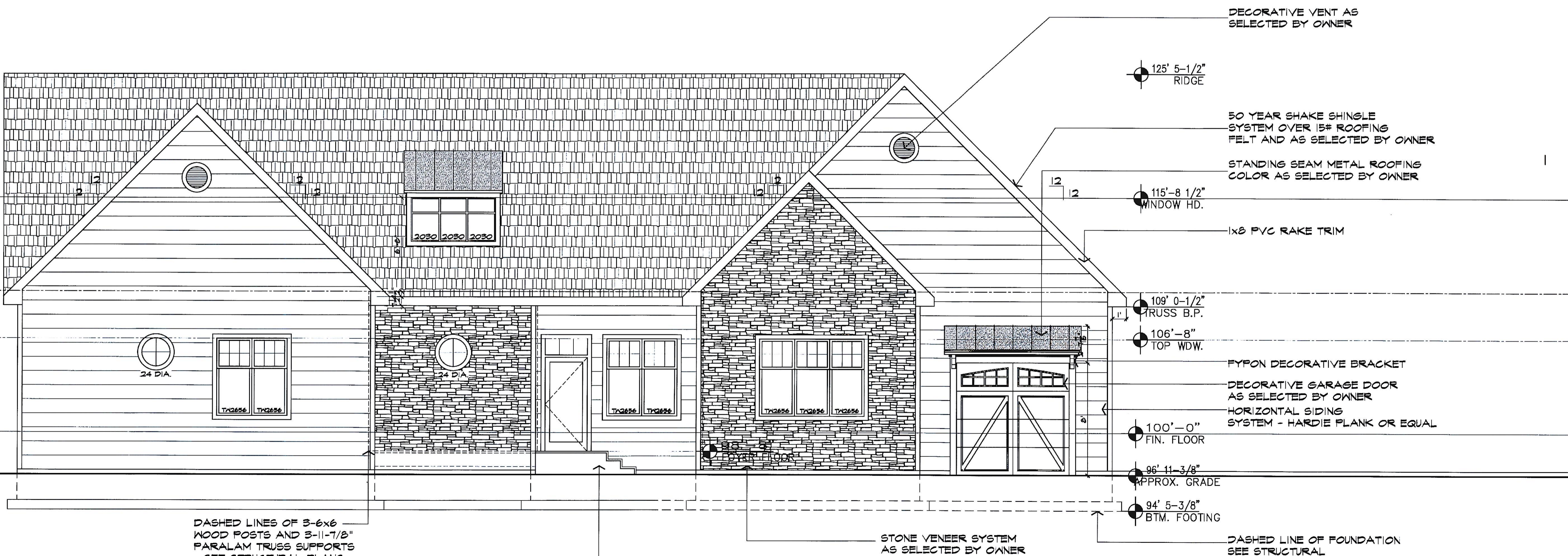
2 NORTH ELEVATION SCALE: 1/4"=1'-0"

DASHED LINES OF 3-6x6 WOOD POSTS AND 3-11-7/8" PARALAM TRUSS SUPPORTS - SEE STRUCTURAL PLANS