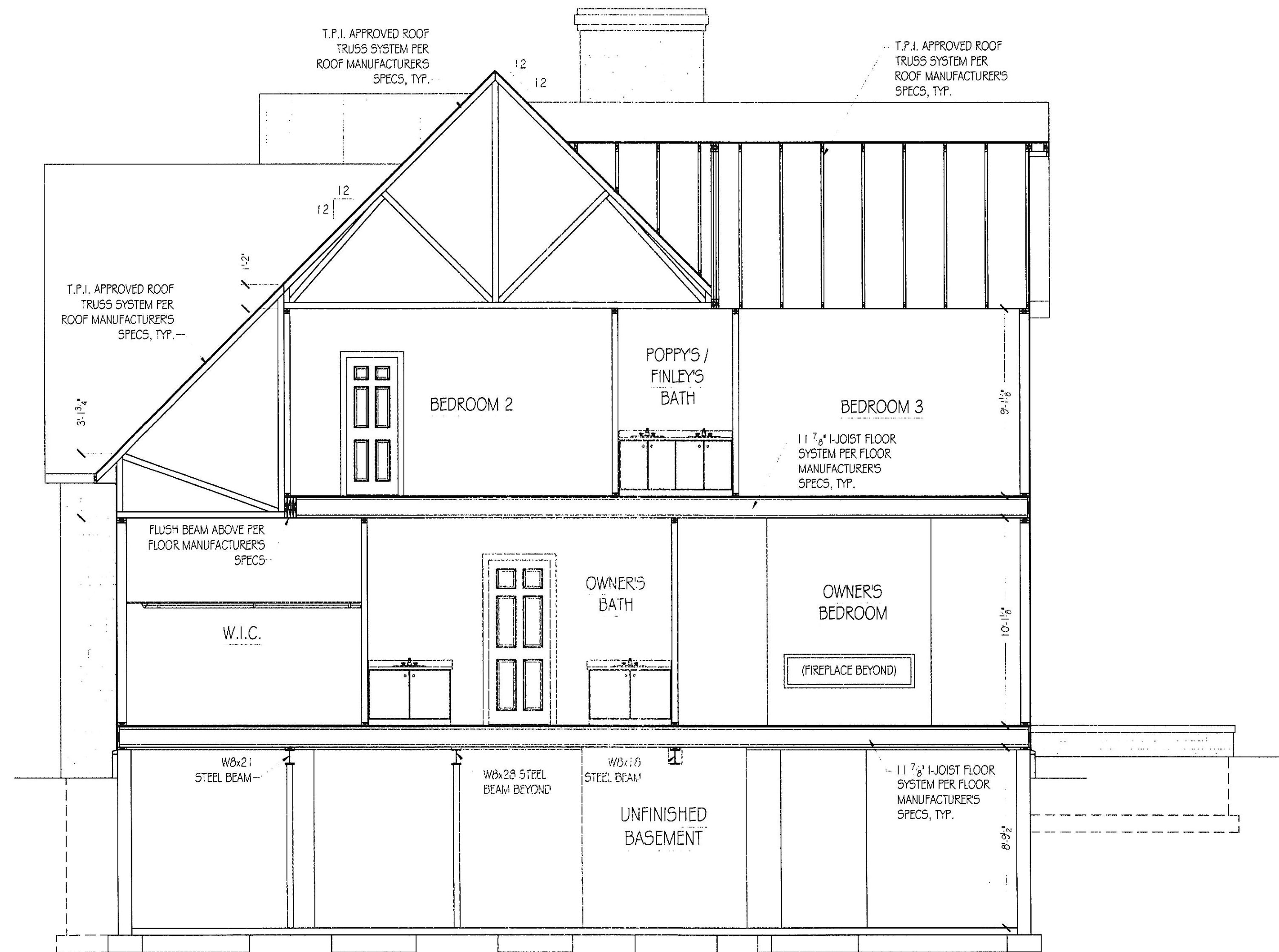
SECTION 3 SCALE: 1/4" = 1'-0"