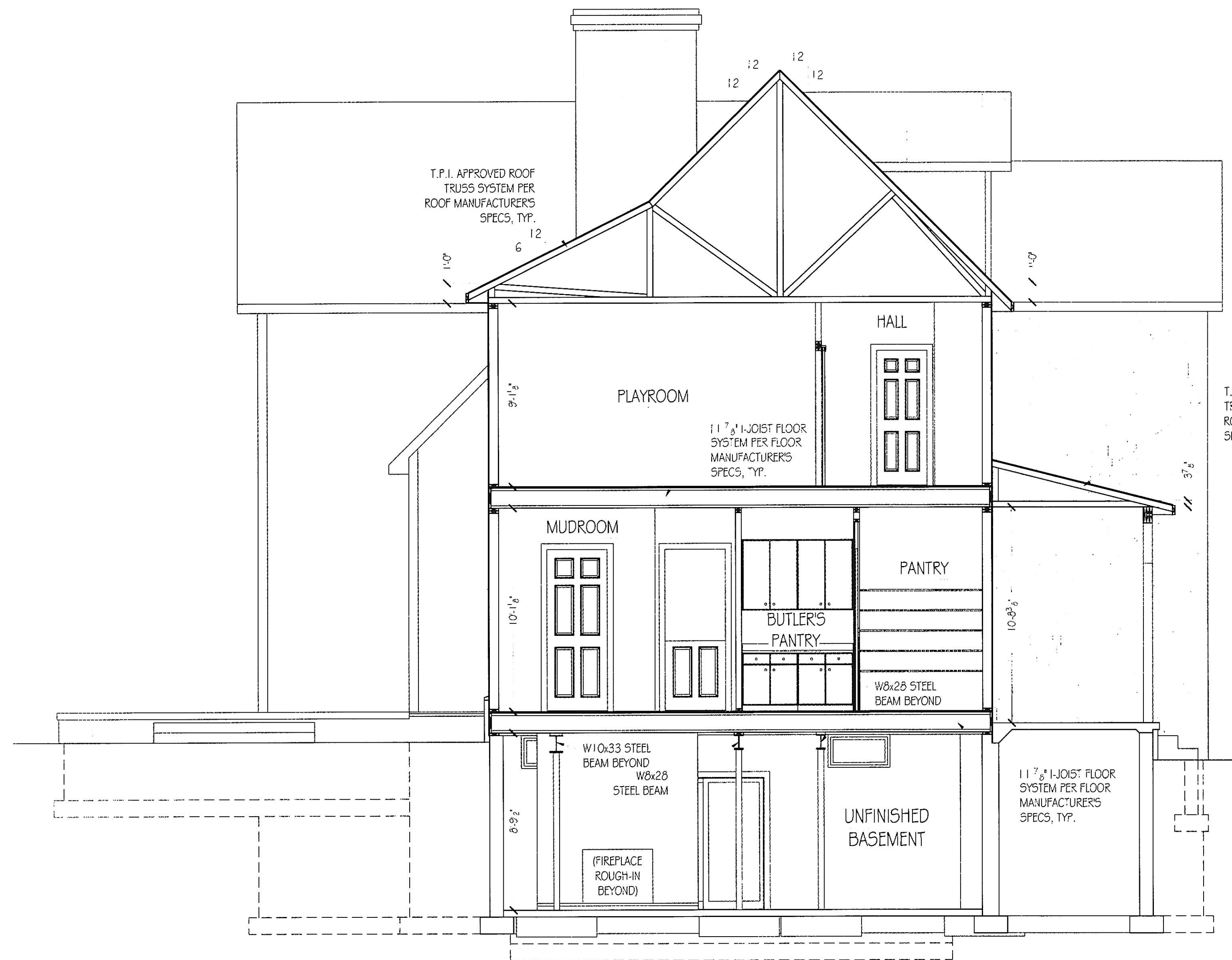
SECTION 2 SCALE: 1/4" = 1'-0"