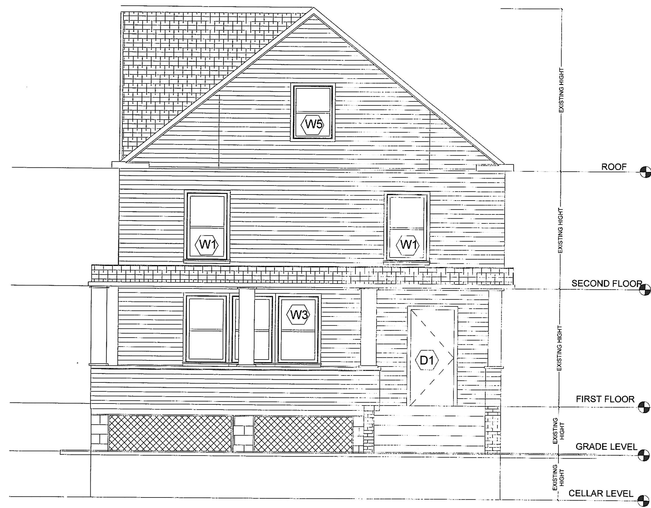
PROPOSED FRONT VIEW SCALE = 1/4"=1'-0"