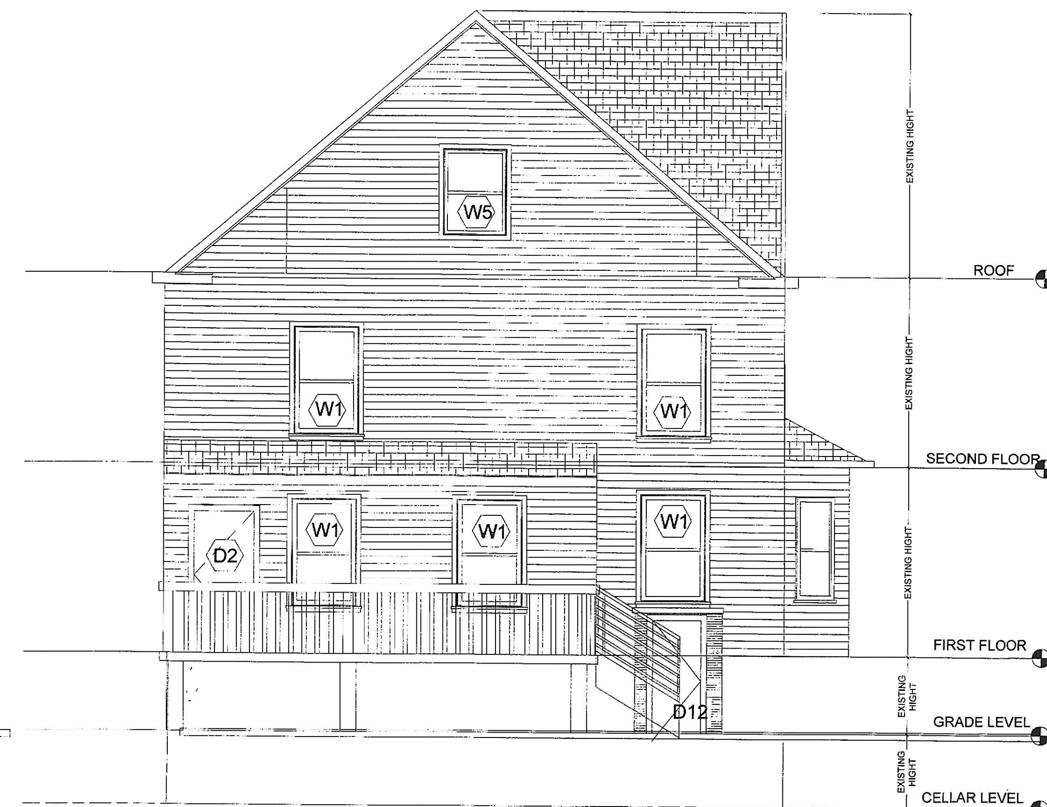
PROPOSED REAR VIEW SCALE = 1/4"=1'-0"