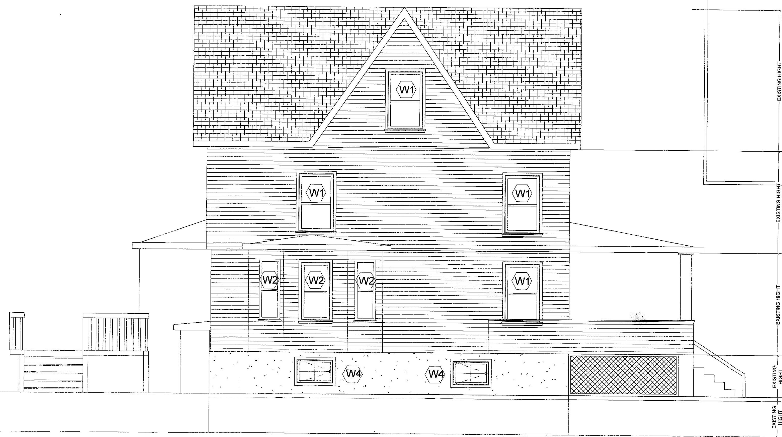
PROPOSED SOUTH (RIGHT) VIEW SCALE = 1/4"=1'-0"