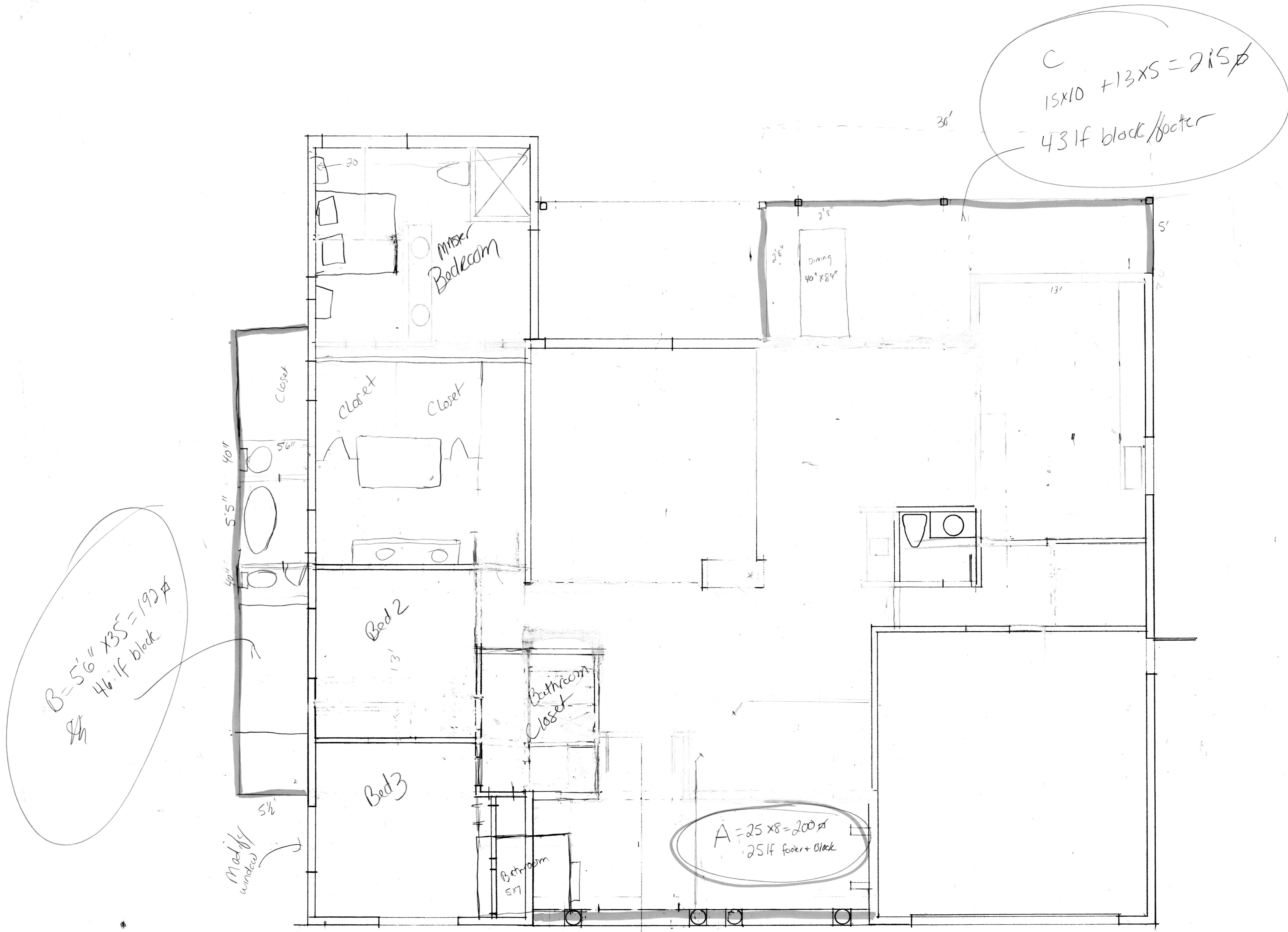
EXISTING FLOOR PLAN 1/4"

ROCKIS RESIDENCE 936 McCLEARY STREET DELRAY BEACH FLORIDA