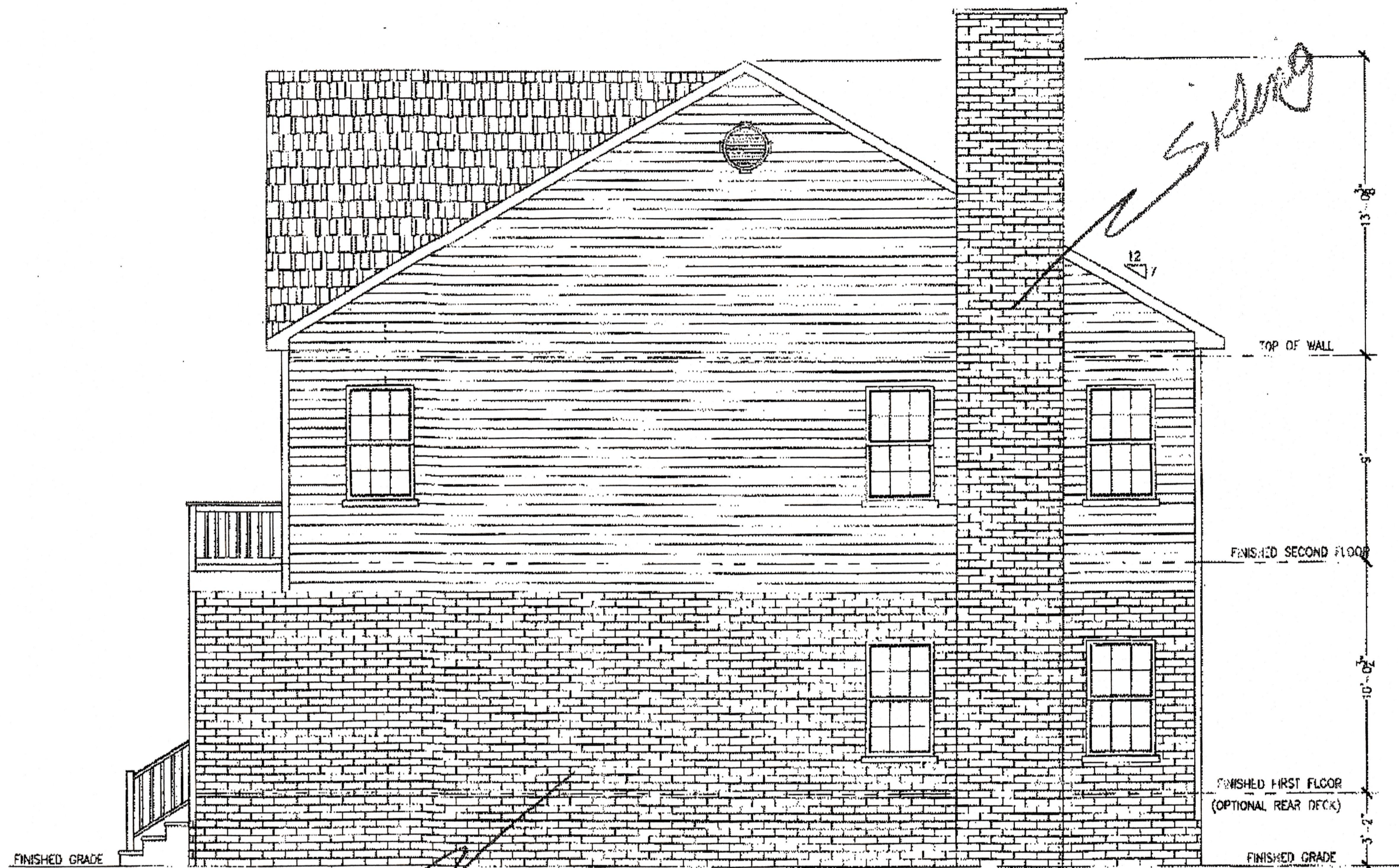
RIGHT SIDE FINISHED ELEVATION SCALE: 1/2" = 1'-0"