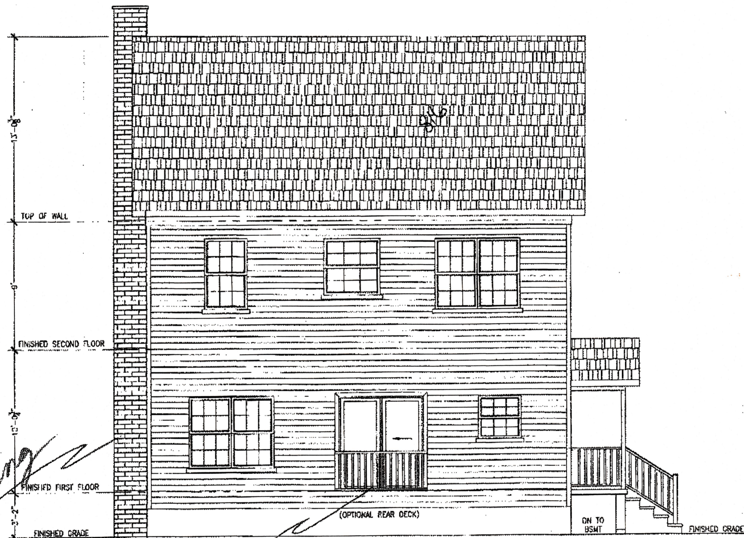
REAR FINISHED ELEVATION SCALE: 1/2" = 1'-0"